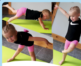
Gym-Fit at Home